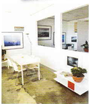
Meeting room Functional polished concrete floors