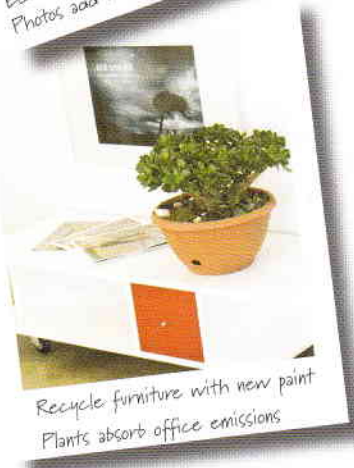
Recycle furniture with new paint Plants absorb office emissions