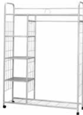
'Reddy' robe, $129, Freedom.