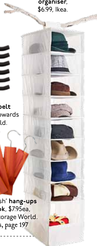
'Skubb' organiser, $6.99, Ikea.