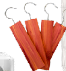
'Cedar Fresh' hang-ups with hook, $7.95ea, Howards Storage World. Stockists, page 197