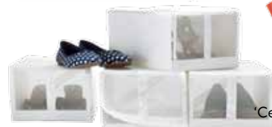
'Skubb' shoe boxes, $19.99/pack of 4, Ikea.